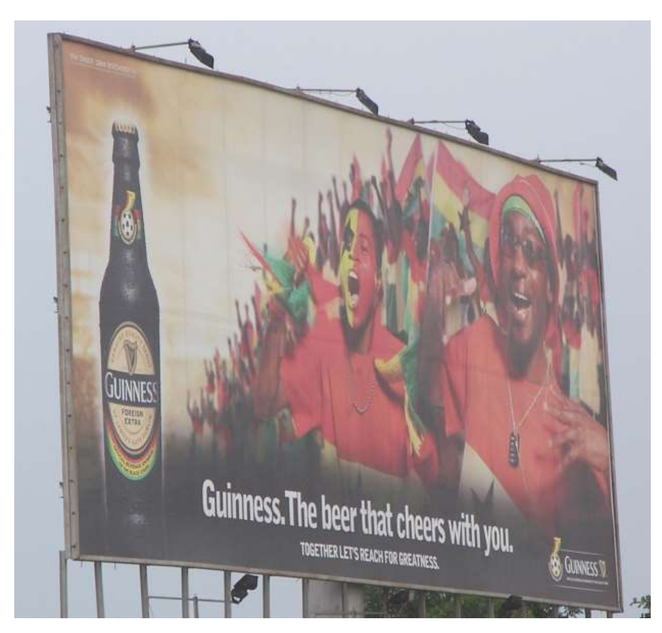
Figure 7. Example of ad rated by experts as depicting minors (billboard, Ghana)