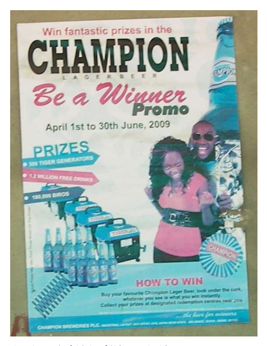
Figure 6. Example of violation of G2 (poster, Nigeria)