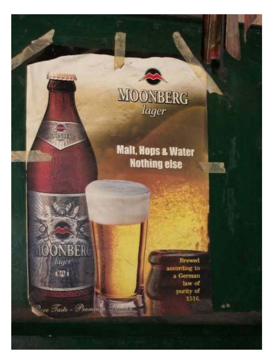
Figure 2. Example of ad with no violation (poster, Uganda)