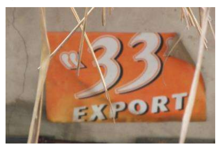
Figure 1. Example of pre-screened ad without clear violation