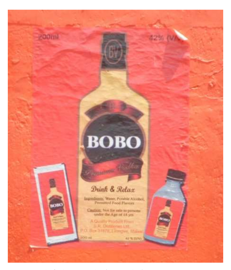
Figure 3. Example of violations G3 and G5 (poster, Malawi)